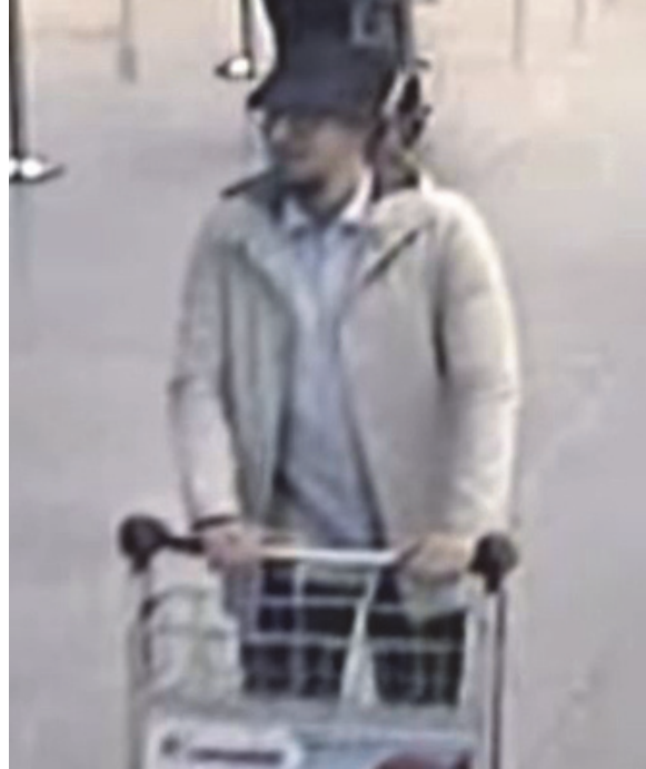
CCTV image from Belgium’s Zaventem Airport of the “man in the hat,” a prime suspect in the airport bombing.